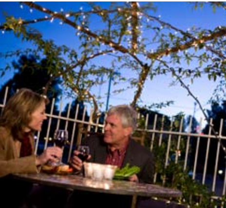
BLUE SKIES: (left to right) Dining alfresco; Hiking in Sedona.

With more than 300 days of sunshine a year, Arizona's weather is ideal for just about anything outdoors.